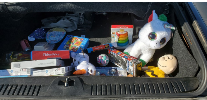
Trunks Full Of Toys