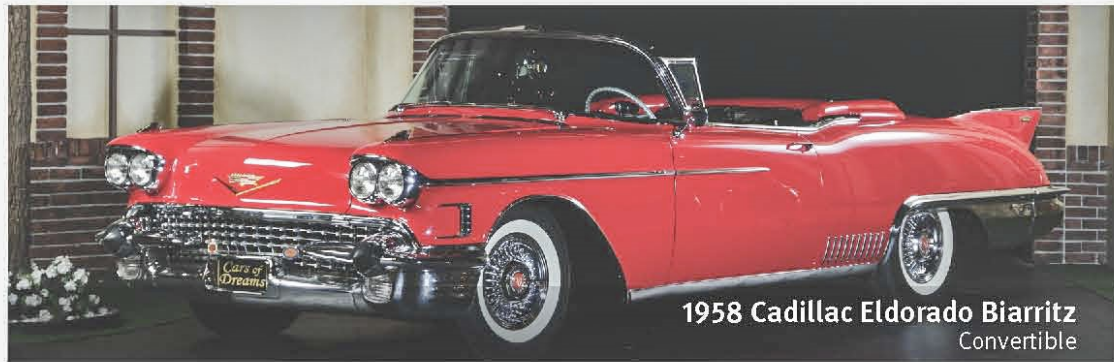
1958 Cadillac Eldorado Biarritz Convertible