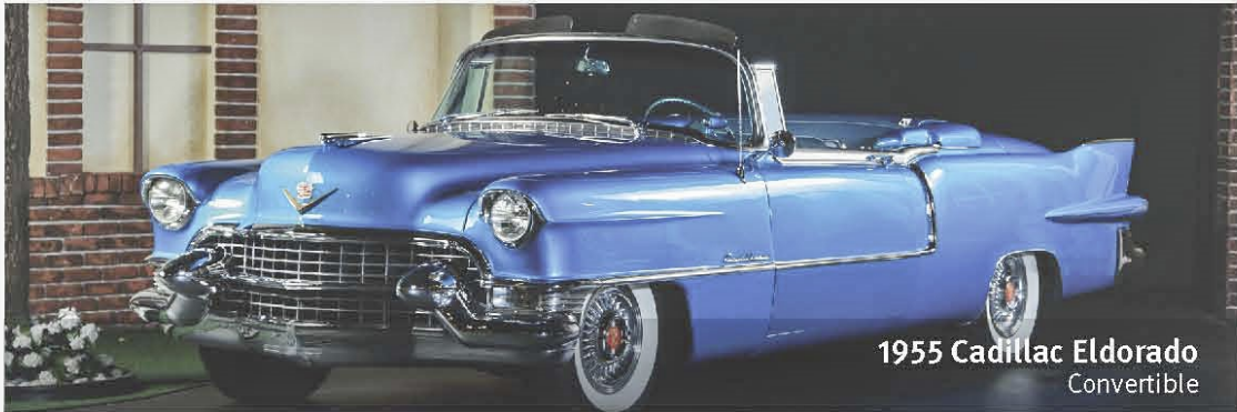
1955 Cadillac Eldorado Convertible