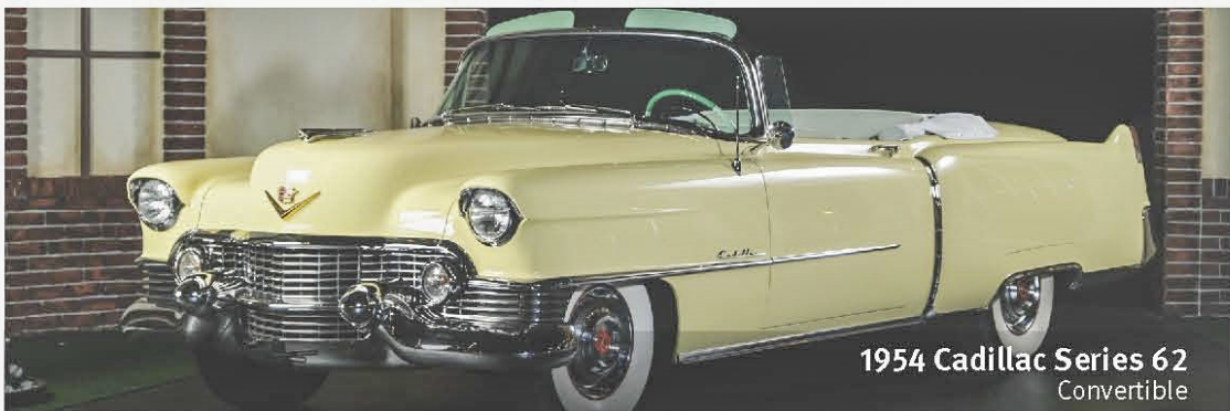
1954 Cadillac Series 62 Convertible