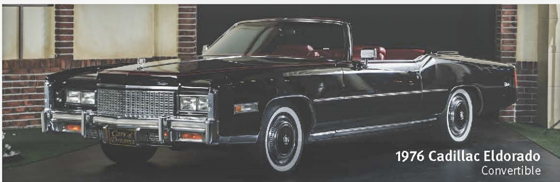
1976 Cadillac Eldorado Convertible

View online at Leakecar.com To bid or consign call 602.442.3380